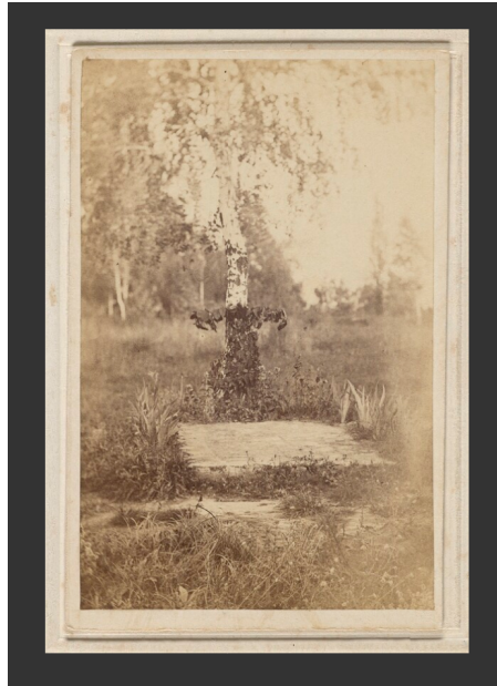
Illustration 5: Unidentified grave adjacent to birch tree made to look like a cross, circa 1865.