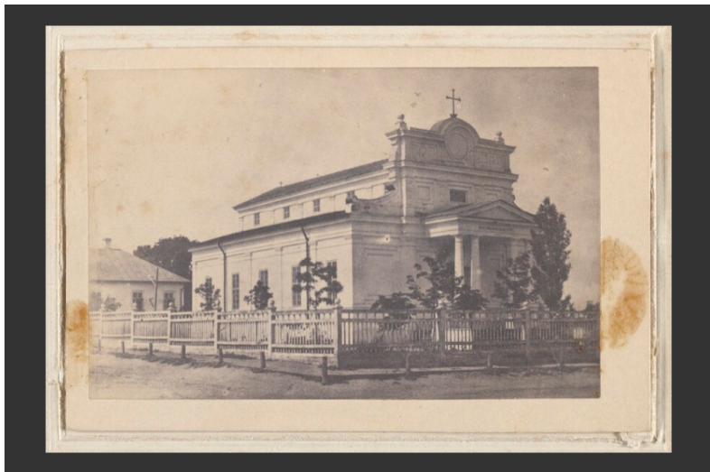
Illustration 4: 19th century Roman Catholic church in Chernihiv, 1865.