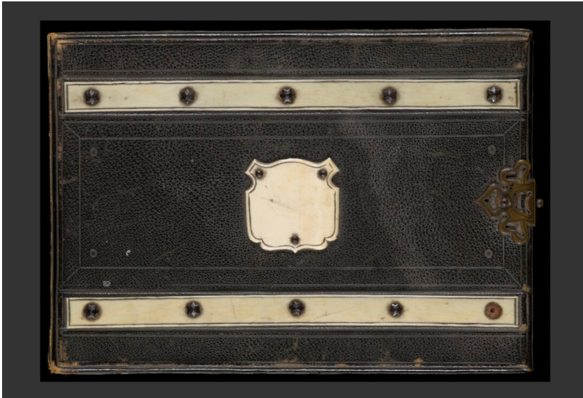
Illustration 1: Joseph Conrad photograph album of his Polish relatives, 1850s-1860s. Joseph Conrad papers, David M. Rubenstein Rare Book & Manuscript Library, Duke University, URL: https://repository.duke.edu/dc/1aef9c22-1085-42fd-9849-31eeb6e7e762/jcpst001001